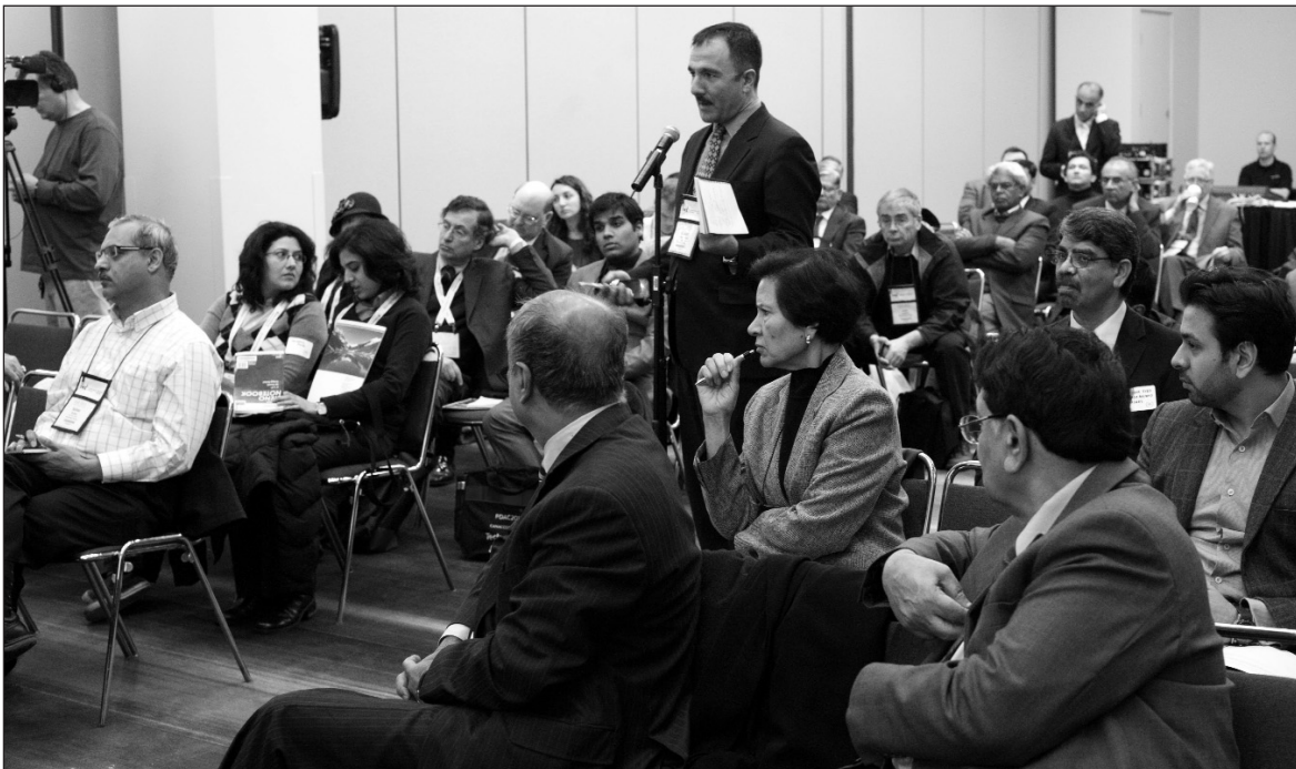
A view of delegates and media representatives attending CPCoC sponsored seminar in Toronto on March 3, 2013.